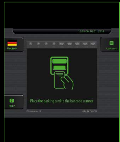
LCD display + video guide