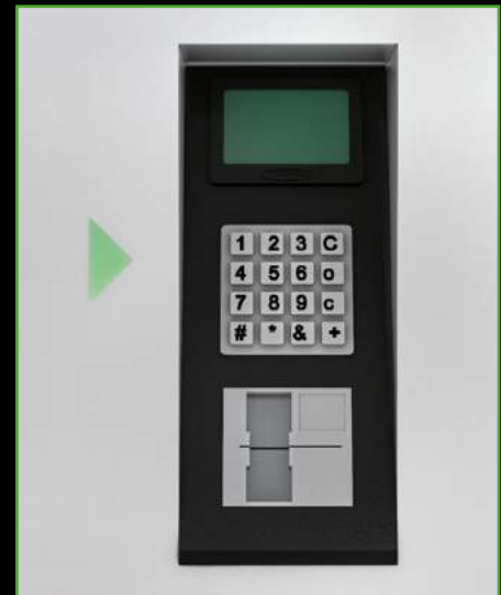
payment cards terminal