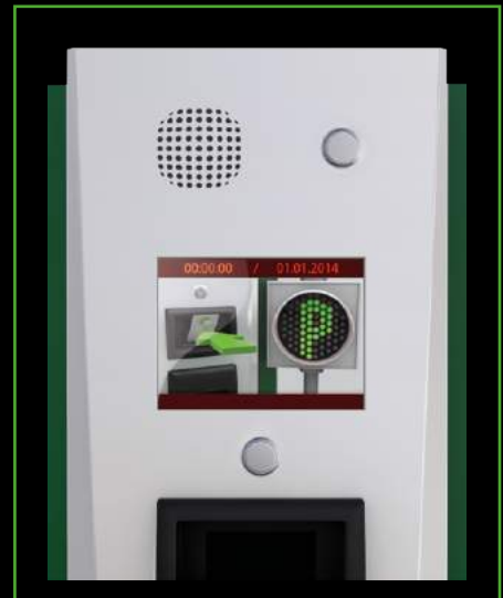
video guide on the front panel