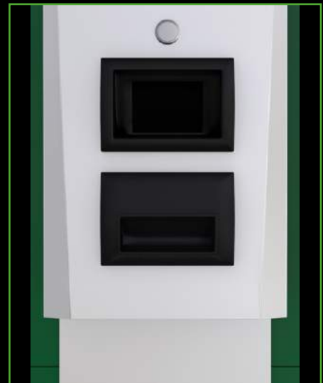
entry terminal front panel