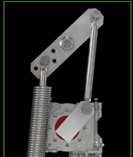
barrier lever mechanism